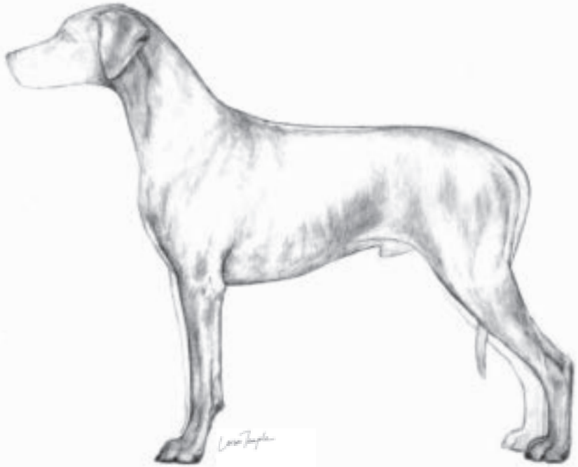
SIDE PROFILE (STANDING)

fast, but he lacks the ability to stop, turn and maneuver which is required by the Standard. Overall balance and symmetry is most important.