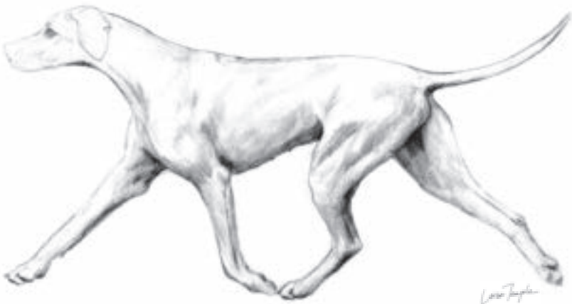
SIDEGAIT – RIGHT EXTENDED (FEMALE)

Elaboration: Shoulders: The shoulder blades should be long, well laid back and sloping; upper arm is of equal length and placed so that the elbow falls directly under the withers.