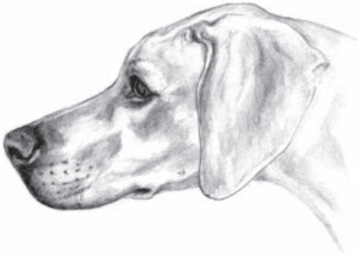
FEMALE PROFILE HEAD