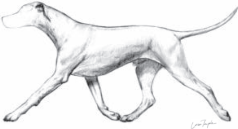
SIDEGAIT – LEFT EXTENDED (MALE)