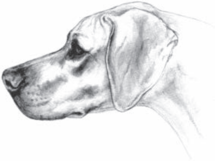
MALE PROFILE HEAD