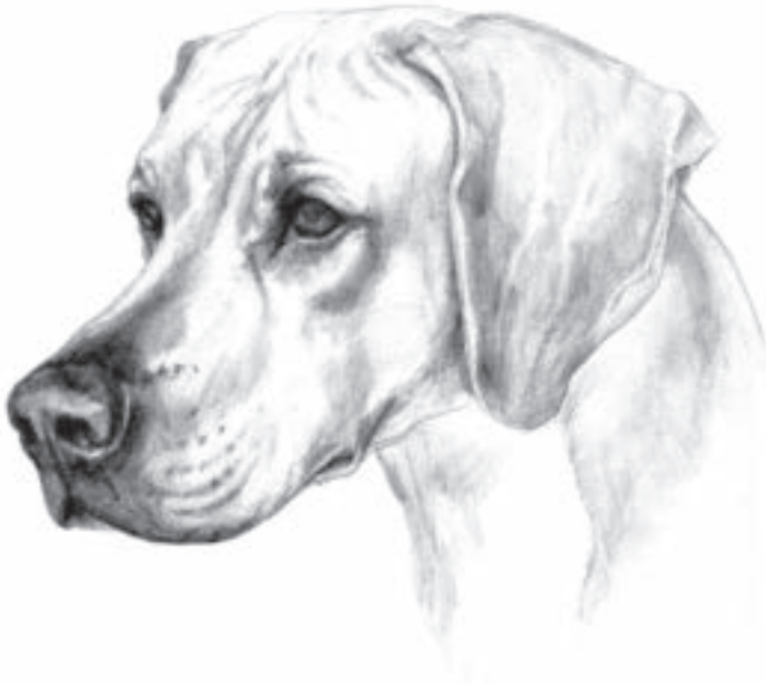
MALE 3/4 VIEW HEAD