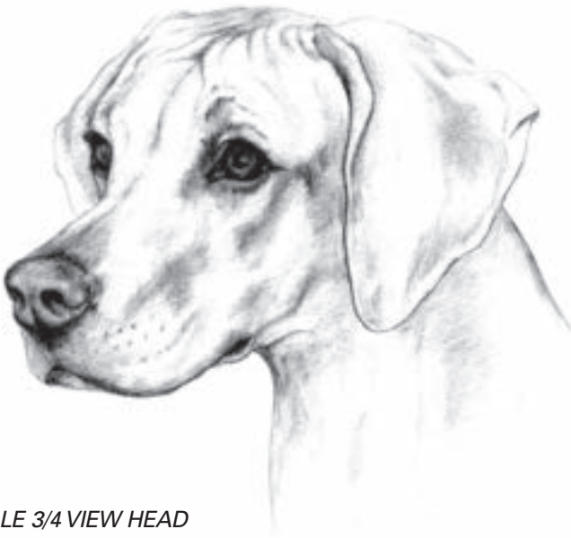
FEMALE 3/4 VIEW HEAD